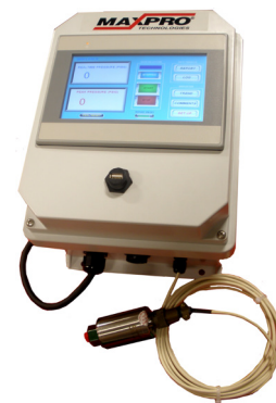
Pressure Data Logger