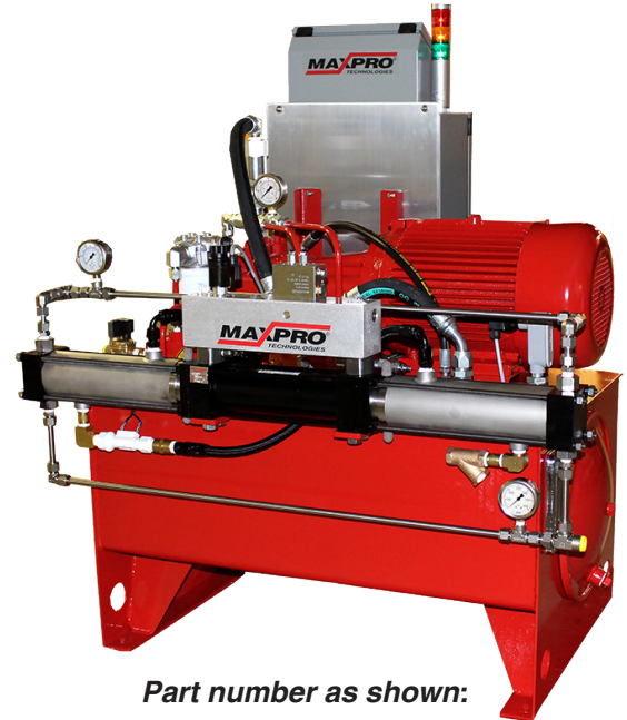
Part number as shown: MTHI1.5-10-PLC